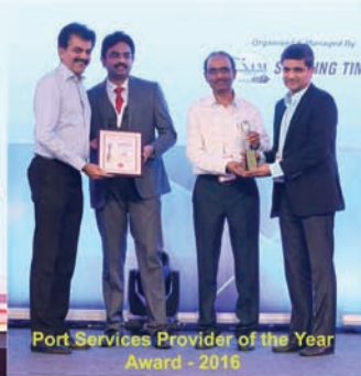
Port Services Provider of the Year Award - 2016