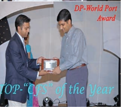
DP-World Port Award