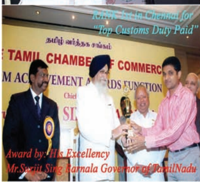
"Top Customs Duty Paid"