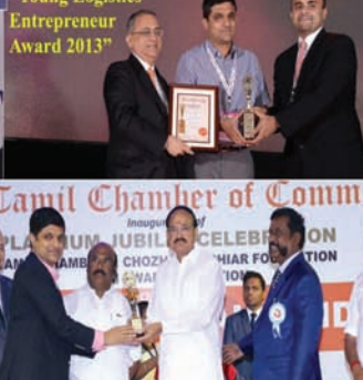
"Young Logistics Entrepreneur Award 2013"