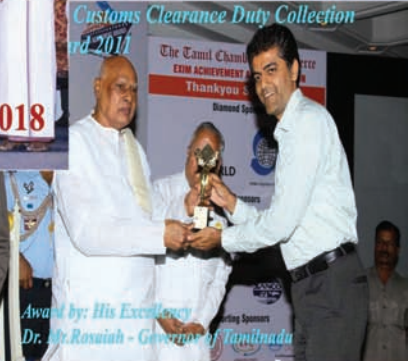
Customs Clearance Duty Collection Award 2011