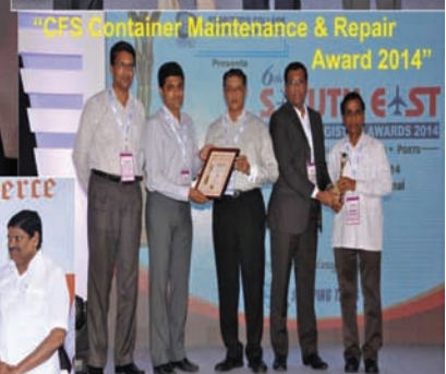
"CFS Container Maintenance & Repair Award 2014"