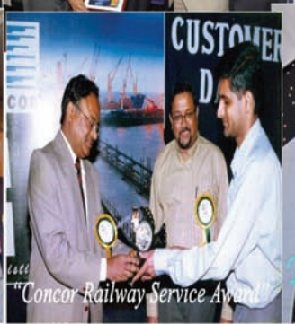
"Concor Railway Service Award"