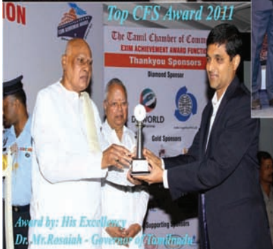
Top CFS Award 2011